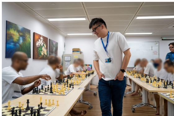
Simultaneous exhibition in the first session

have agreed to continue the program and also help SPS's Prison School launch a chess club in February 2024. The long-term goal of SPS and the SCF is to build a viral chess community within Prisons and in the long term, provide statistical evidence of the benefits that chess can bring to inmates, and further reduce the already impressive low recidivism rates in Singapore.