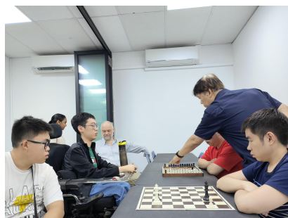
Para Chess Training