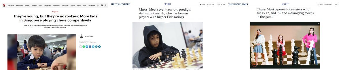
Media coverage on the SCF's National Training Program and our trainees.

relationship with the media, not just locally but also globally, with most of our news being reports of strong performances from our athletes. We keep these articles on our website which you can visit here ( https://singaporechess.org.sg/media/ ). The one recent "not so positive" that you might have read was that of a defamation lawsuit that was filed in 2015. Thankfully, that case has finally concluded and we hope to move forward with more positive coverage of our work and the results from our local athletes.