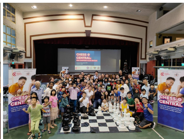
Chess @ Central - The Kampong Glam Edition