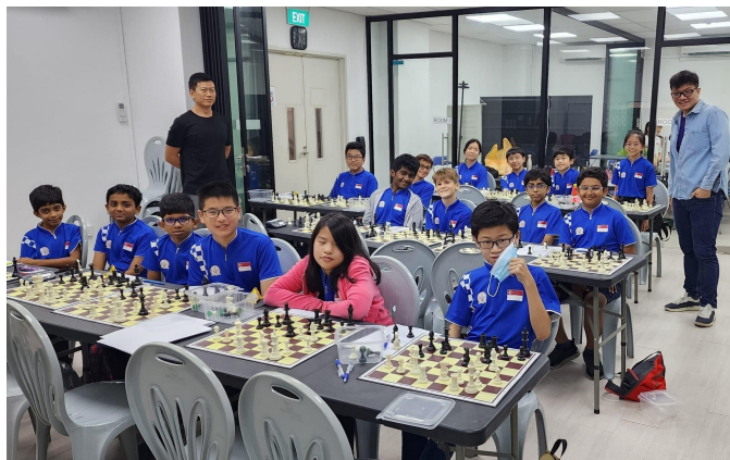
The National Training Program